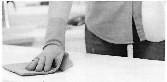
Item No. 903018