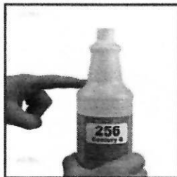
Fill With Water