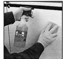
Spray N Wipe All Surfaces